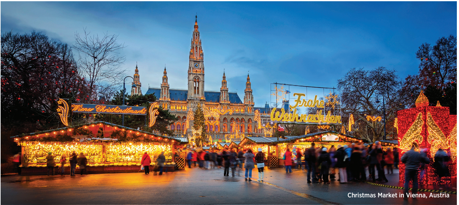
Christmas Market in Vienna, Austria