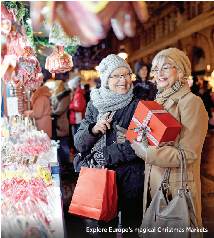
Explore Europe's magical Christmas Markets