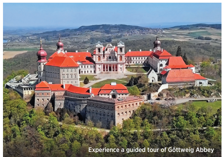
Experience a guided tour of Götweig Abbey