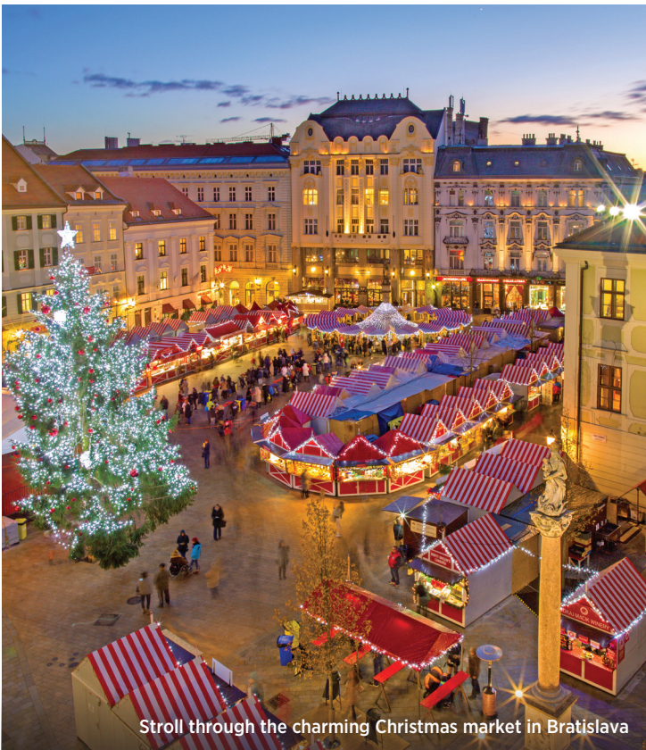
Stroll through the charming Christmas market in Bratislava

Today, enjoy a morning sailing on your Star-Ship as it sails through the fascinating Wachau Valley, part of the UNESCO World Heritage-listed Wachau Cultural Landscape. This afternoon, embark on a guided tour of Göttweig Abbey, a true treasure overlooking the valley from a hill covered by vineyards and forests. Built in 1083, it's one of Austria's most important Benedictine abbeys, attracting visitors from around the globe. Run by a community of about 45 monks, it's visible from a great distance and provides epic panoramas from the grounds. As part of the tour you get to taste the delightful Göttweig wine, which is a tradition well kept by the monks throughout centuries. Meals: B, L, D