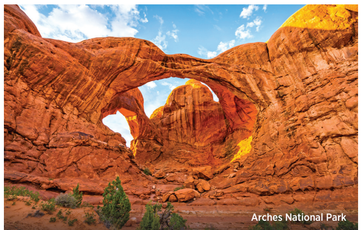
Arches National Park