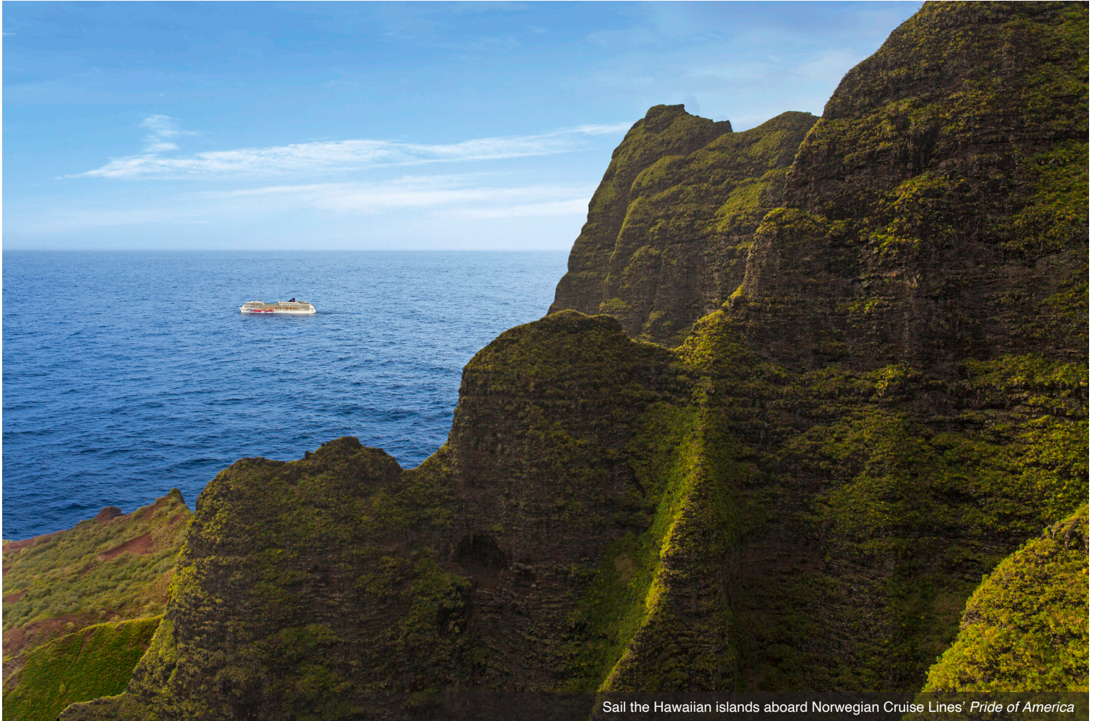
Sail the Hawaiian islands aboard Norwegian Cruise Lines' Pride of America