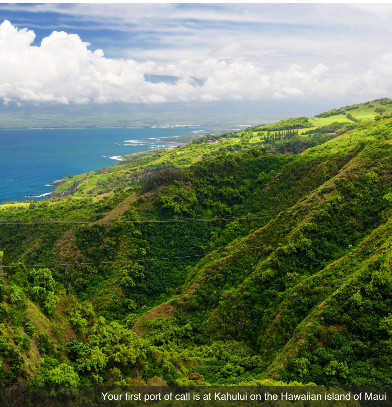
Your first port of call is at Kahului on the Hawaiian island of Maui

DAYS 10 AND 11 Return Flight Home: After disembarking in Honolulu, a group transfer brings you to the airport for flights home after 12:00 p.m. For those who wish, you can make your own arrangements to visit the USS Arizona Memorial en route to the airport through NCL while on board the ship. Please ensure your flights are booked out after 6:00 p.m. if you consider this excursion. Fly through the night and return home in the morning. Meal: B