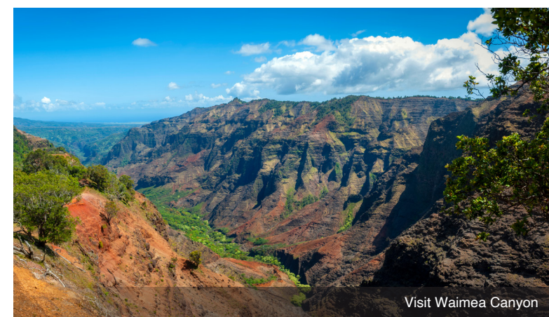
Visit Waimea Canyon