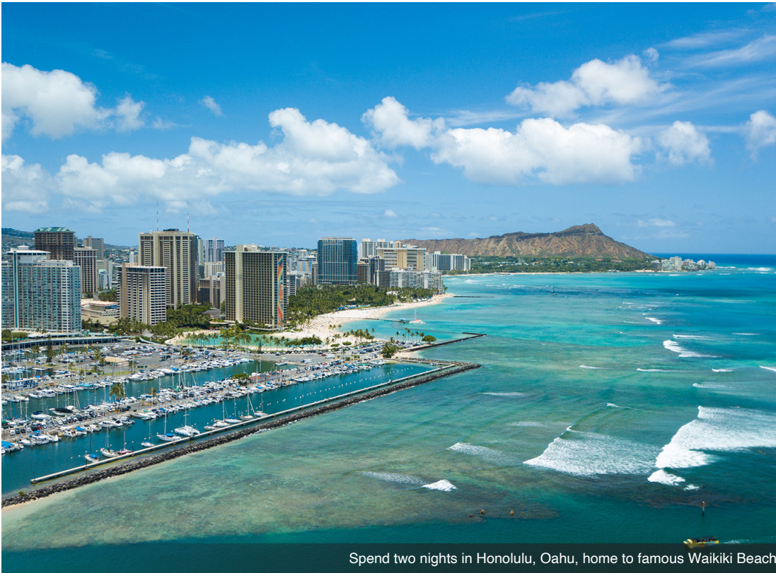
Spend two nights in Honolulu, Oahu, home to famous Waikiki Beach