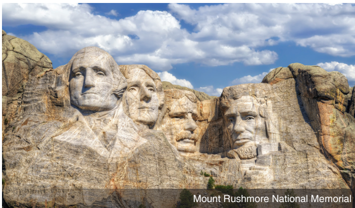
Mount Rushmore National Memorial

DAY 6 Travel Home: After breakfast, a group transfer to the Rapid City airport is available for flights out after 10:00 a.m. Meal: B