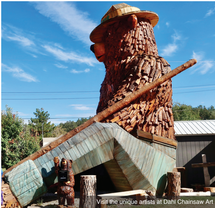
Visit the unique artists at Dahl Chainsaw Art

Enjoy time for shopping and an on own lunch. Then, a local guide takes you through Badlands National Park, a uniquely beautiful geologic area formed over millions of years by wind, rain and erosion. Return to Rapid City for a farewell dinner featuring the entertainment of an Indian dancer, storyteller and flute player.