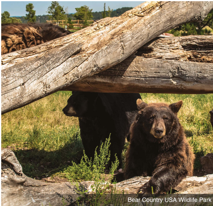
Bear Country USA Wildlife Park

an on own lunch. Then, a local guide takes you through Badlands National Park, a uniquely beautiful geologic area formed over millions of years by wind, rain and erosion. Return to Rapid City for a farewell dinner featuring the entertainment of an Indian dancer, storyteller and flute player. Meals: B, D