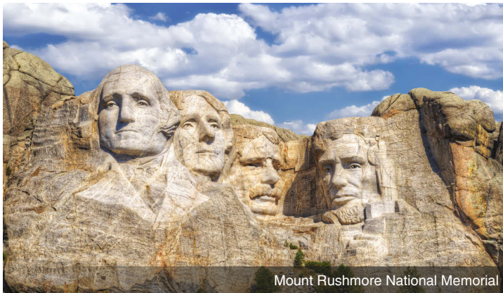
Mount Rushmore National Memorial

DAY 6 Travel Home: After breakfast, a group transfer to the Rapid City airport is available for flights out after 10:00 a.m. Meal: B