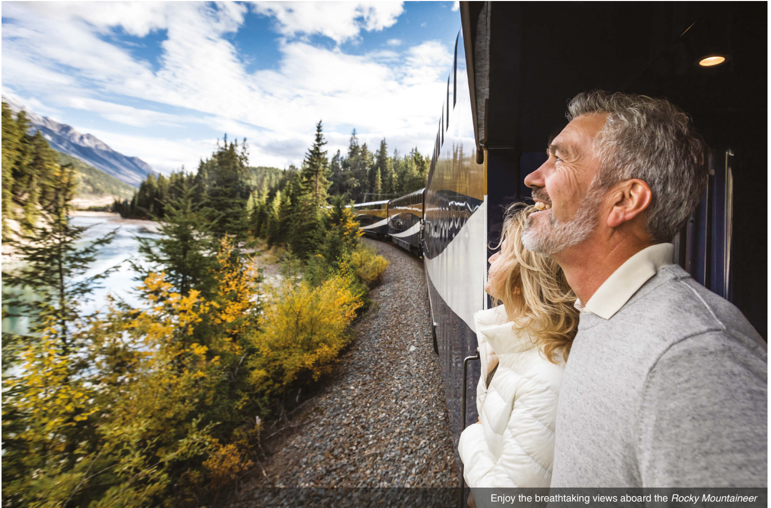
Enjoy the breathtaking views aboard the Rocky Mountaineer