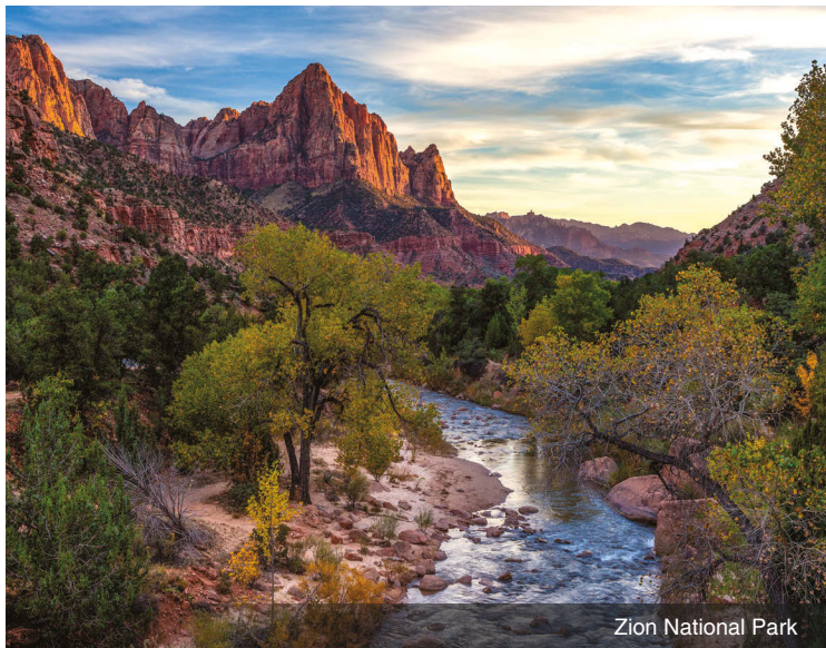
Zion National Park