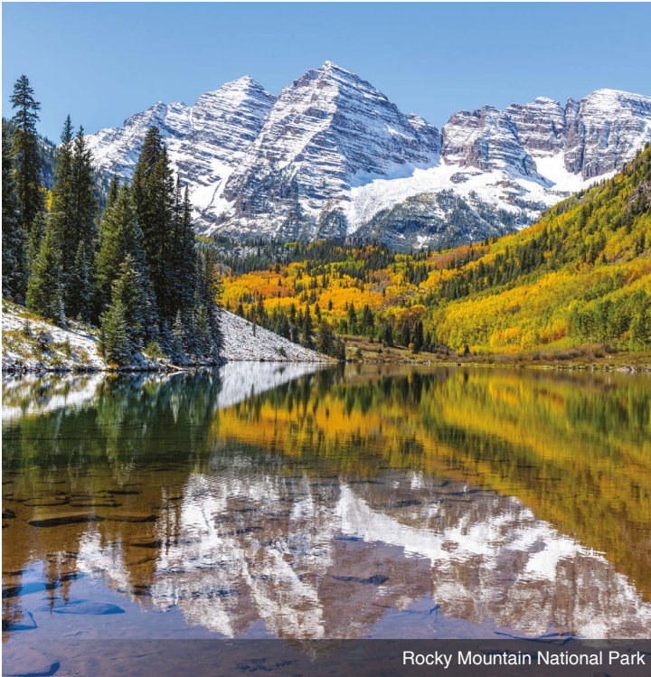
Rocky Mountain National Park