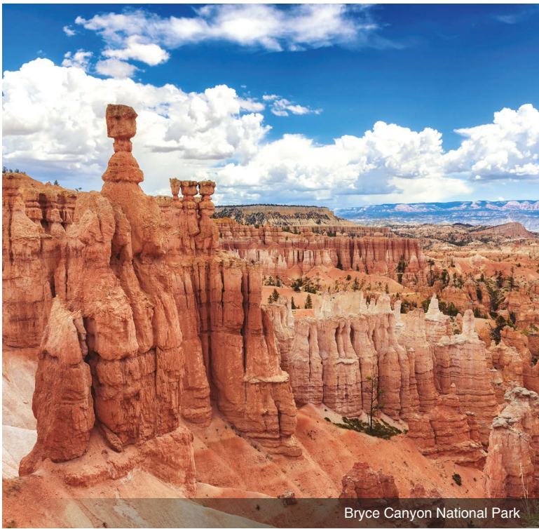
Bryce Canyon National Park

DAY 7 Homeward Bound: This morning a group transfer to Harry Reid International Airport is available for flights home departing after 12:00 p.m. Meal: B